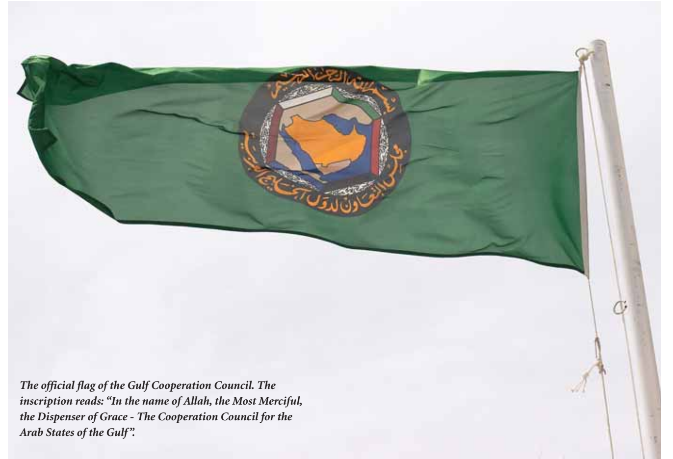
The official flag of the Gulf Cooperation Council. The inscription reads: "In the name of Allah, the Most Merciful, the Dispenser of Grace - The Cooperation Council for the Arab States of the Gulf".

مدة حماية براءة الاختراع عشرون سنة، وبالرغم من ذلك ليس هناك شهادات حماية تكميلية وينطبق هذا الأمر على الدول الأعضاء في معاهدة التعاون بشأن البراءات أو الدول المنضوية تحت لواء معاهدة باريس.